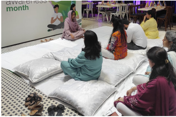
ARTS AND WELLNESS SESSION FOR ENGRO CORP. IN PARTNERSHIP WITH KARACHI BIENNALE TRUST