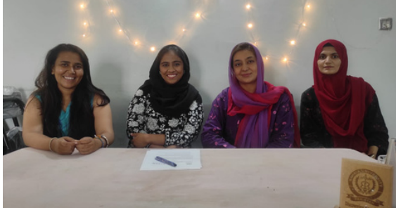
CARE FOR HEALTH

PHC Global, this year expanded the impact of their work to collaborate with other organizations. Given our methodological approach to public health, these Memorandum of Understanding (MOU) were signed to put our efforts together to address issues in evidence generation, advocacy, capacity-building, and science.