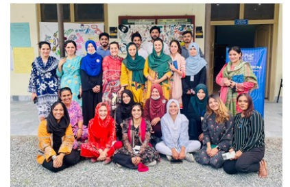
SOCIAL WELFARE DEPARTMENT, GILGIT-BALTISTAN