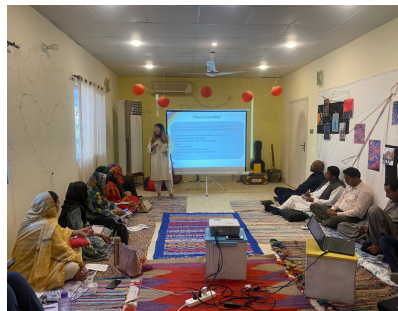
HOUSE OF PEBBLES