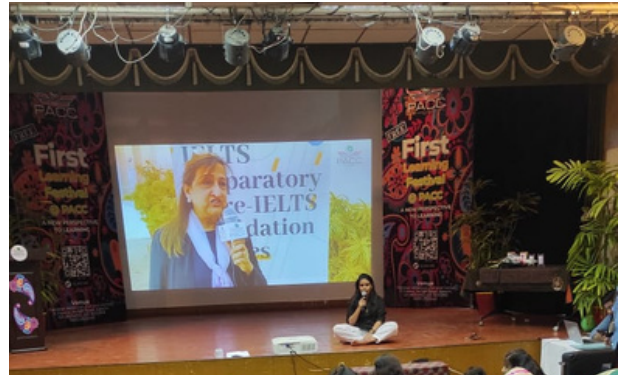
SOCIAL EMOTIONAL AWARENESS SESSION FOR LEARNING FESTIVAL BY PAKISTAN AMERICAN CULTURAL CENTRE