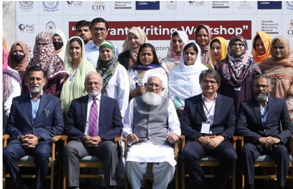
2ND GRANT WRITING WORKSHOP Riphah University, Rawalpindi, Pakistan