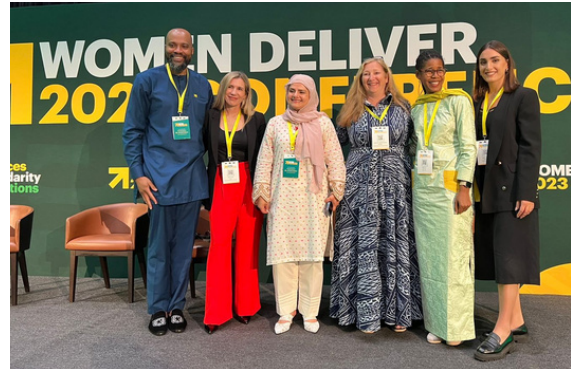
WOMEN DELIVER CONFERENCE 23 Kigali, Rwanda