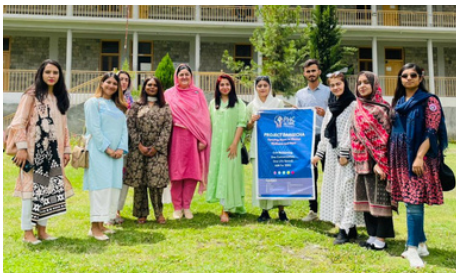
KARAKORUM INTERNATIONAL UNIVERSITY GILGIT