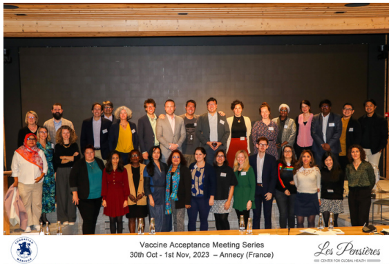
FOUNDATION MÉRIEUX'S VACCINE ACCEPTANCE CONFERENCE Anancy, France