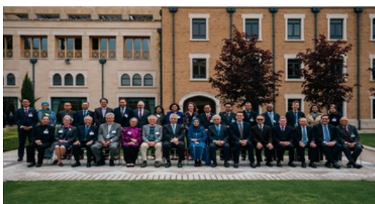
OXFORD CENTRE FOR ISLAMIC STUDIES - UTM SCIENCE ROUNDTABLE Oxford, United Kingdom