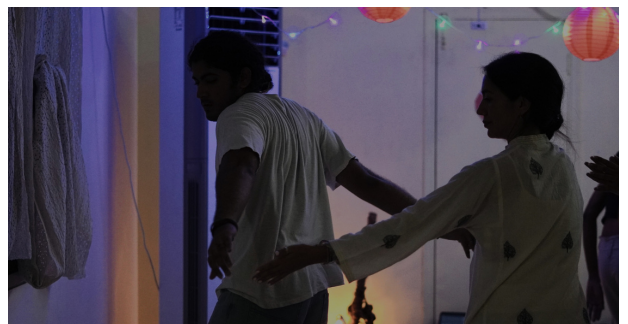
CONTACT BEYOND CONTACT WORKSHOP BY NATALIA BARAHONA NOSEDA