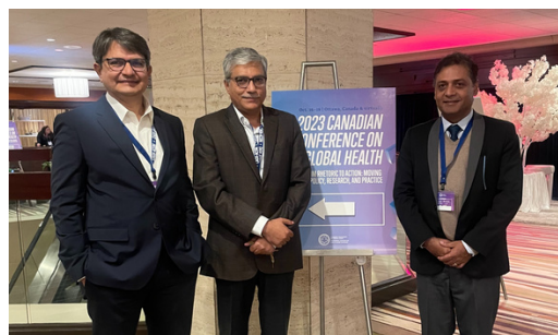
CANADIAN CONFERENCE ON GLOBAL HEALTH Ottawa, Canada